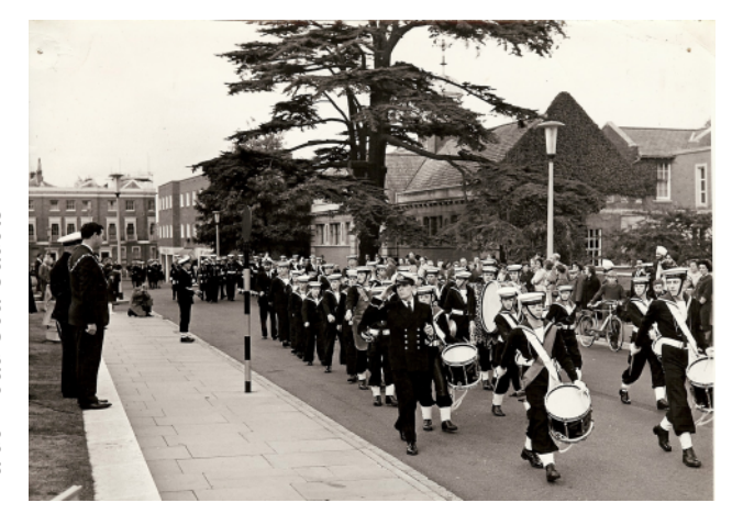
TS Iron Duke band at Maidenhead's Remembrance Day Parade in 1964