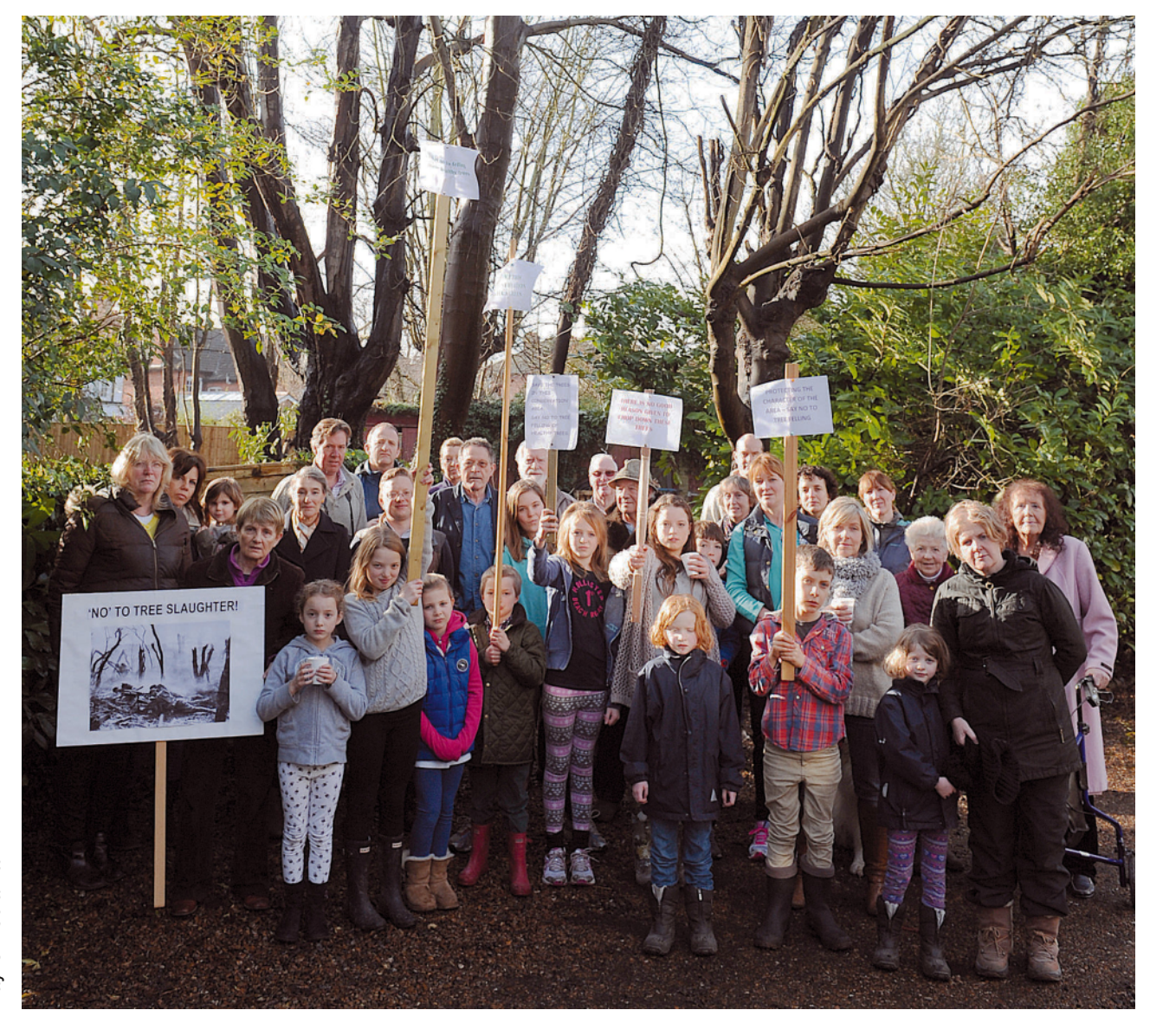
Baylis Media Ltd

It's a travesty that on 29th January this year the woodland was virtually eradicated, destroying the character of this leafy neighbourhood. One of the reasons planning applications to build new housing have been refused is that the trees "...are protected by virtue of their location on a Conservation Area". And further, since "The proposals... would result in the loss of several mature trees which contribute to the amenities of the Conservation Area and the locality as a whole [they are] therefore contrary to policy EP4 of the South Bucks District Local Plan".