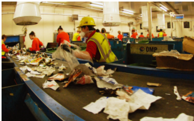
Women working in one of the sorting rooms. They have to concentrate on the fast-moving lines and pick off anything that cannot be recycled.

Emptying lorry loads into landfill was simple but the modern waste collection sorting and recycling programme is a sophisticated triumph of logistics. SBDC's waste contractor Biffa collects from 28,000 local households every week.