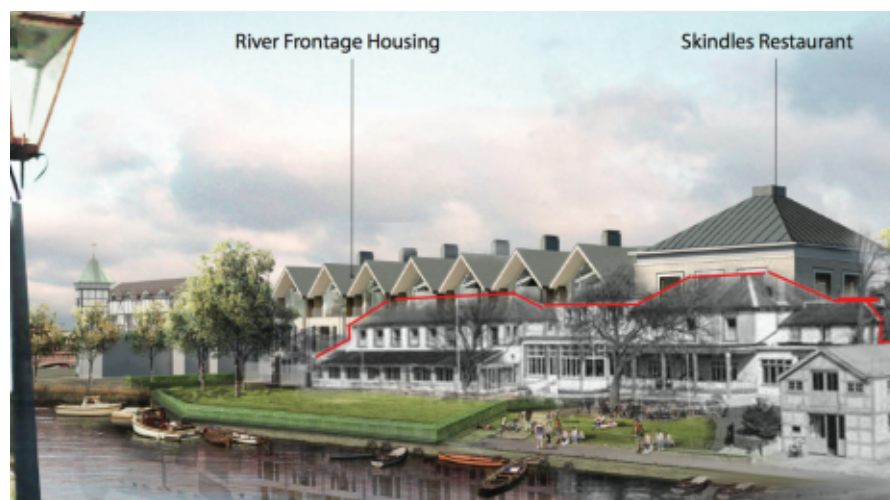
Montage by Fred Russell

SBDC commissioned a study in 2010 which valued the land at around £15m and concluded