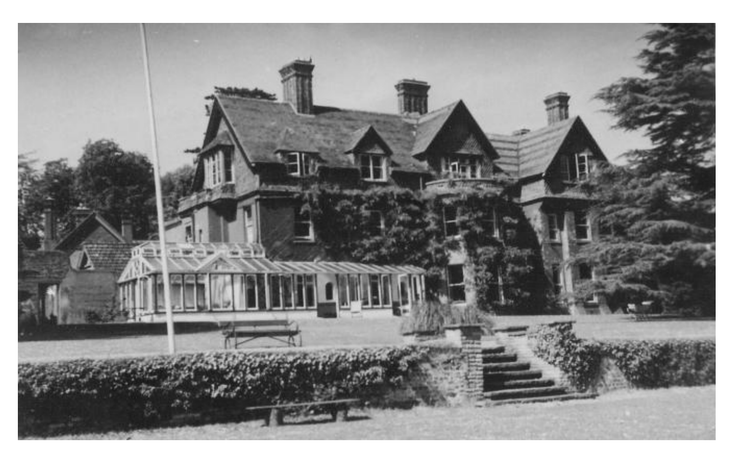
Taplow Hill House

which also made The Red Cottage a hostel for its students. We will pick up this thread later to discover how The Red Cottage became St Nicolas House and Cedar Chase replaced Taplow Hill.