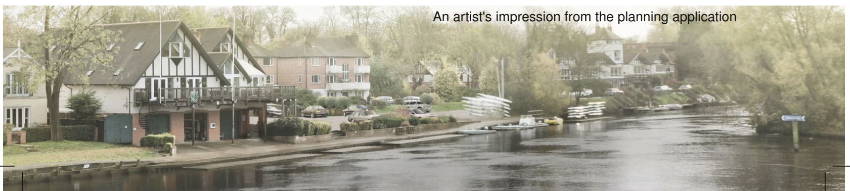
An artist's impression from the planning application