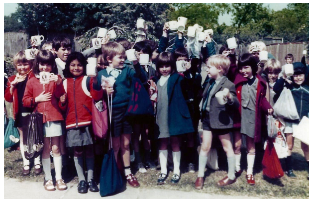
The Queen's Silver Jubilee in 1977: Class 2

around and locked up as usual at 6pm for his short walk home to Pax Cottage. Headmaster Colin Blackwell related what happened next in the school log book: