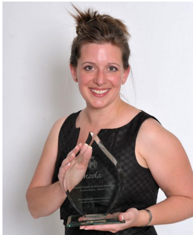
Maidenhead Musical Comedy Society

MMCS have rehearsed at St Nicolas' School and Taplow Village Hall for years. That's where Mum first turned up in 1998 to audition. Now she seems to be a regular for 'turning up' at auditions and has played lots of major roles since, even winning a National Operatic and Dramatic Association (NODA) award for her role in Hello Dolly as Dolly Levi.