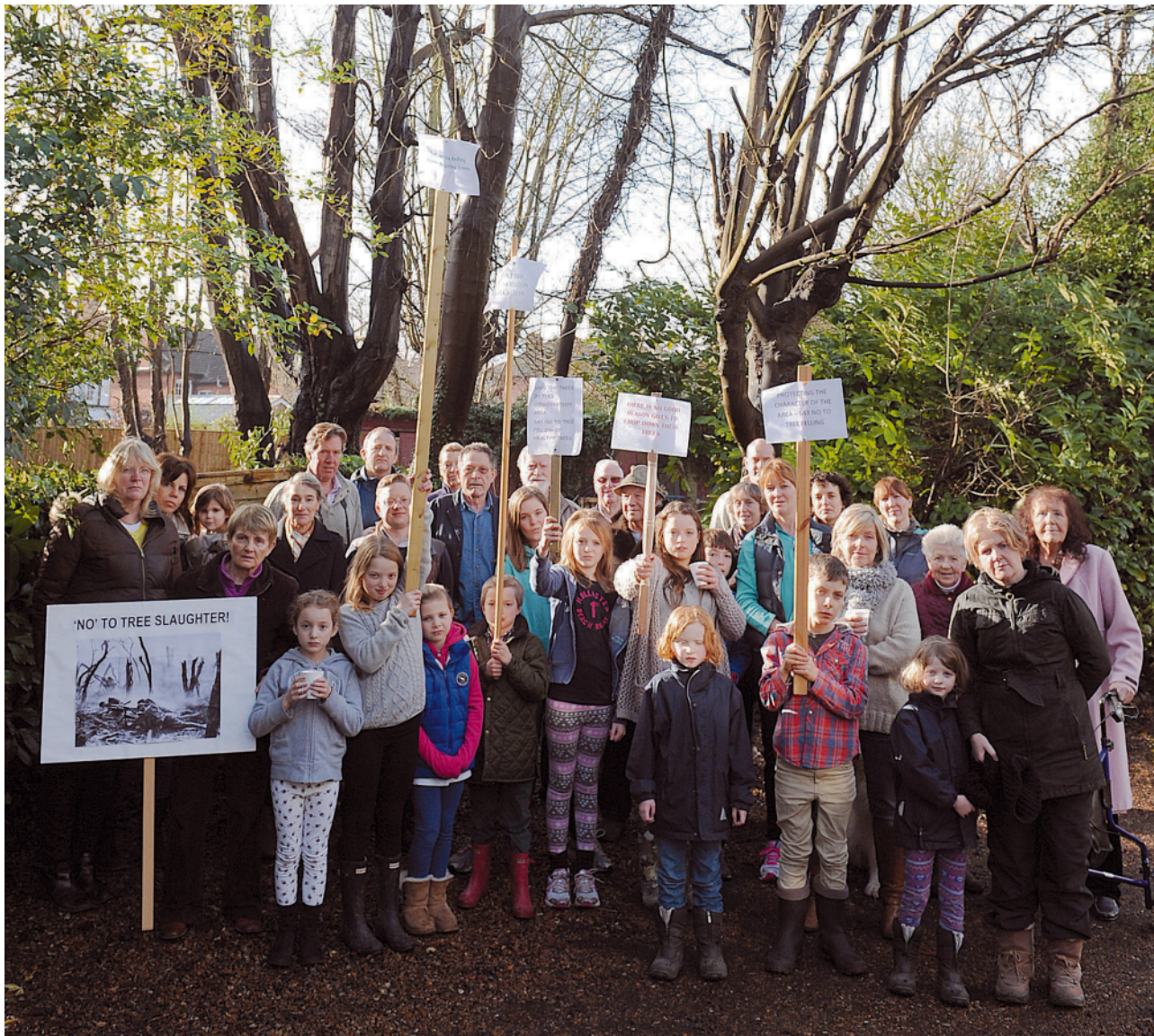
Baylis Media Ltd

It's a travesty that on 29th January this year the woodland was virtually eradicated, destroying the character of this leafy neighbourhood. One of the reasons planning applications to build new housing have been refused is that the trees "...are protected by virtue of their location on a Conservation Area". And further, since "The proposals... would result in the loss of several mature trees which contribute to the amenities of the Conservation Area and the locality as a whole [they are] therefore contrary to policy EP4 of the South Bucks District Local Plan".