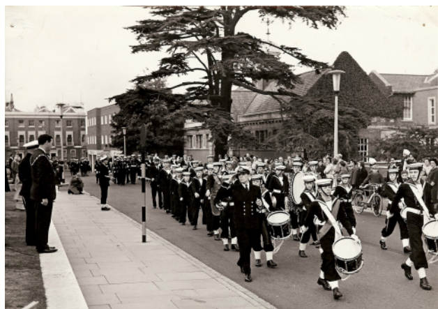
Maidenhead Sea Cadets